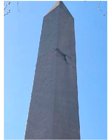
Hambletonian's Obelisk - current condition.