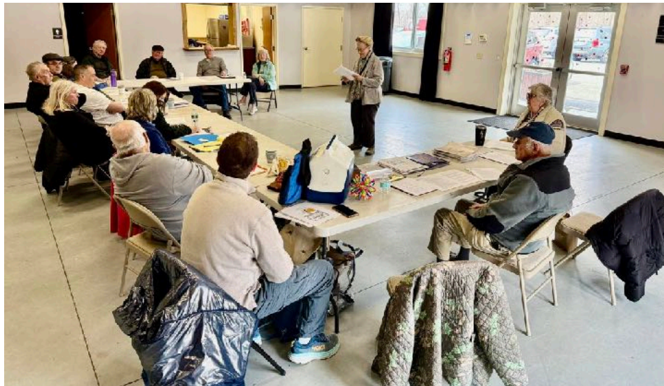
APHNYS Region 3 Meeting