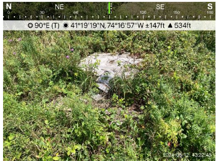
Well Sweep on 2024-08-12.